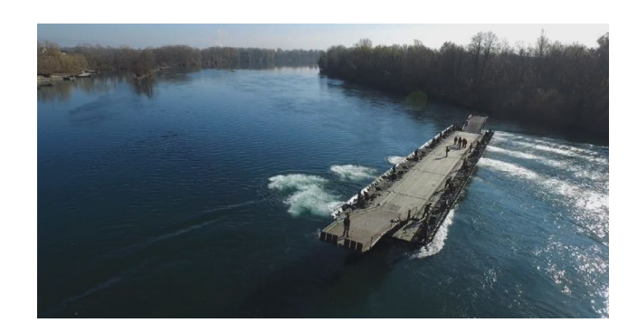
Optimised Cost & Logistical Footprint with 10m long Sections