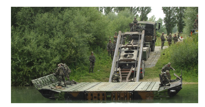
Fastest operational deployment for given length & retrieving Proven launching system