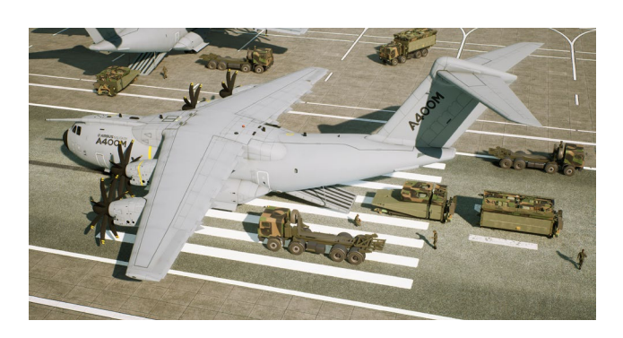
Easy deployment for overseas operations Reduction of logistic footprint / 2 x A400M to transport an MLC40 Ferry / Over 4 500 km distance