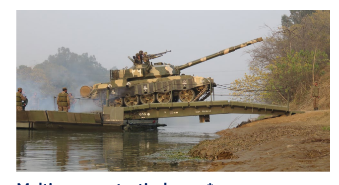
Multi purpose tactical ramp*: / no bank preparation / interoperability with other floating bridges / dry gap crossing