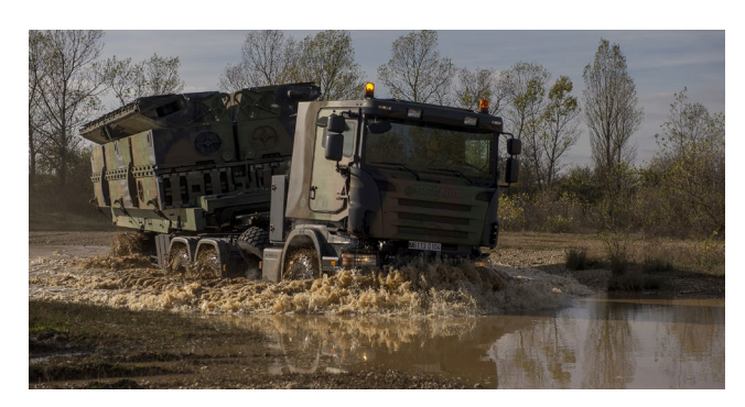
The 6x6 prime mover with semi-trailer offers high land mobility on rough terrain