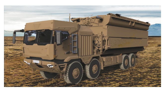
8x8 Military Standard Trucks ensure high maneuverability & less qualified personnel