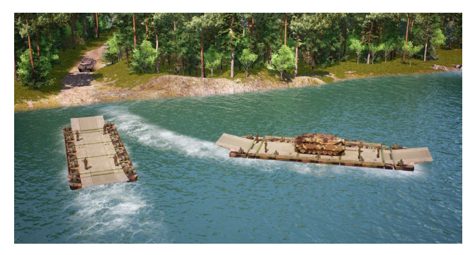
Enhanced maneuverability on the water, seamlessly switching between longitudinal & transversal navigation