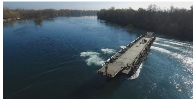
Optimised Cost & Logistical Footprint with 10m long Sections