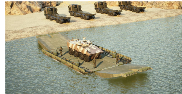
Floating Ramp* / high speed entrance / easy to transport / enhanced floatability