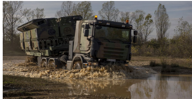
The 6x6 prime mover with semi-trailer offers high land mobility on rough terrain