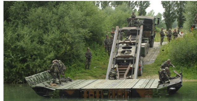
Fastest operational deployment for given length & retrieving Proven launching system