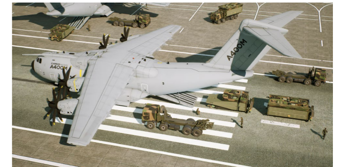
Easy deployment for overseas operations Reduction of logistic footprint / 2 x A400M to transport an MLC40 Ferry / Over 4 500 km distance