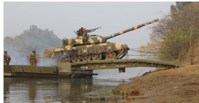
Multi purpose tactical ramp* : / no bank preparation / interoperability with other floating bridges / dry gap crossing