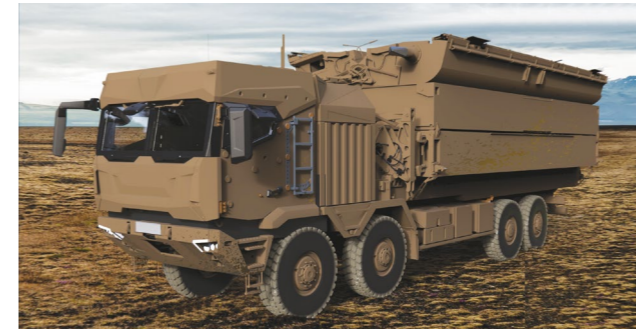
8x8 Military Standard Trucks ensure high maneuverability & less qualified personnel