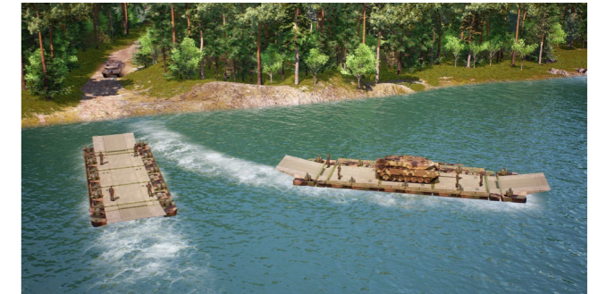
Enhanced maneuverability on the water, seamlessly switching between longitudinal & transversal navigation