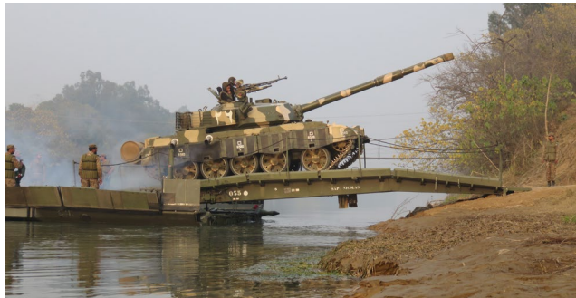
Multi purpose tactical ramp* : / no bank preparation / interoperability with other floating bridges / dry gap crossing