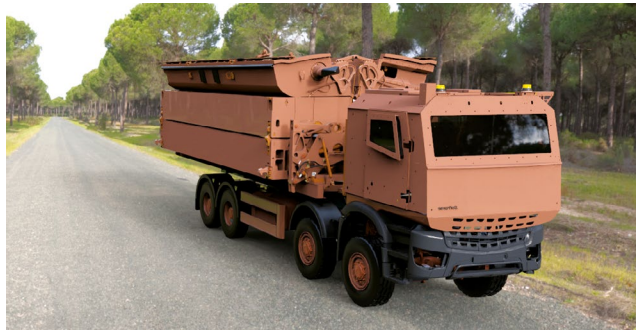
8x8 Military Standard Trucks ensure high maneuverability & less qualified personnel