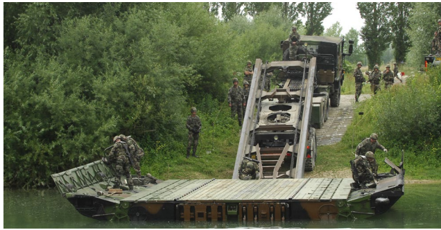
Fastest operational deployment for given length & retrieving Proven launching system