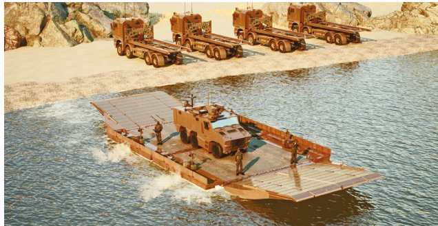
Floating Ramp* / high speed entrance / easy to transport / enhanced floatability