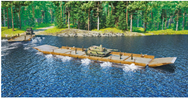
Enhanced maneuverability on the water, seamlessly switching between longitudinal & transversal navigation