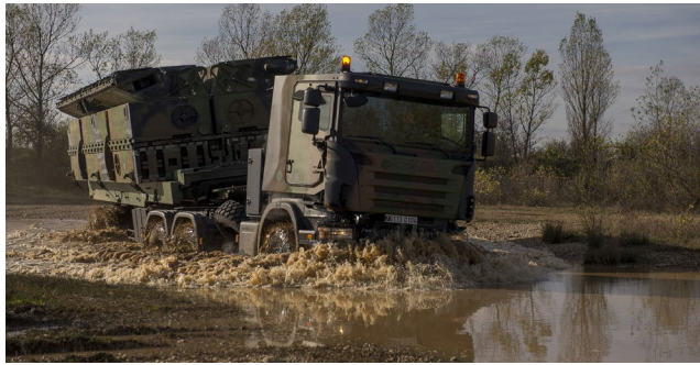
The 6x6 prime mover with semi-trailer offers high land mobility on rough terrain