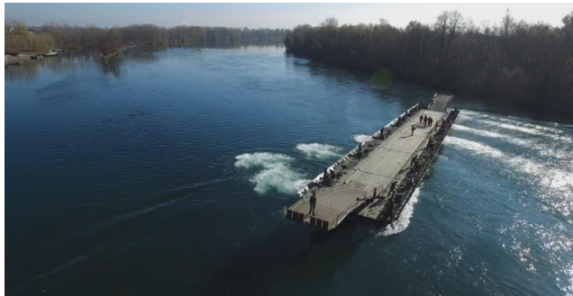
The bridge or ferry can be assembled very quickly, giving the armed forces great agility in operations.