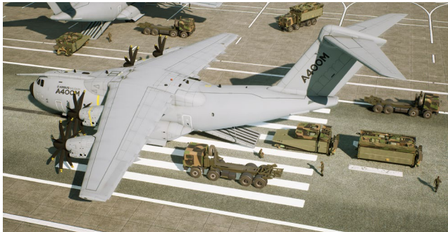
Aerotransportable / A400M / C17