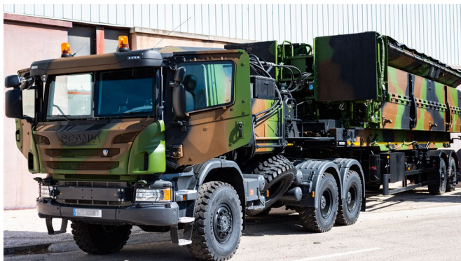
▲ 22 articulated trucks delivered between 2018 and 2021

These adaptations include armoured cabs providing greater operator protection. In addition, short ramps have been integrated into the sections to reduce their logistical footprint.