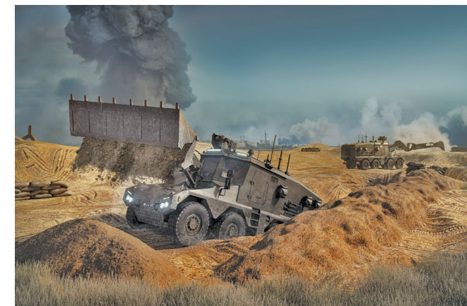
▲ Clearing-up operations in areas of highly intense fighting

The AUROCH is equally suited for use in conflicts and natural disasters in clearing rubble and roads.