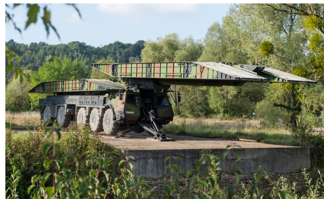
▲ Rapid operation Short bridge (14 m) in 8 min / Long bridge (26 m) in 10 min