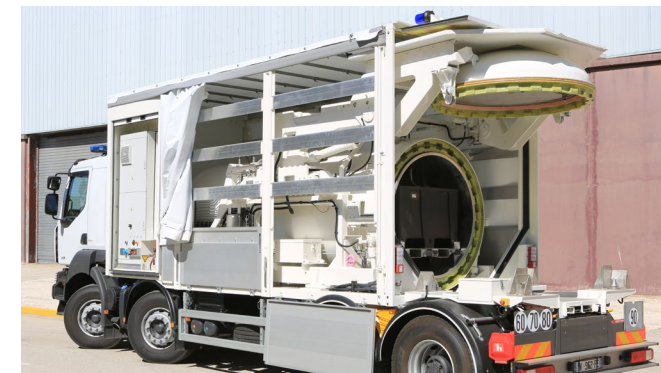
▲ Tank strength: 13 kg eq. TNT

Given the sensitivity and hazardousness of the materials transported, the VTM meets stringent safety standards . Our engineers have tested and qualified the vehicle's stability, integrity when overturned, mechanical strength, etc.