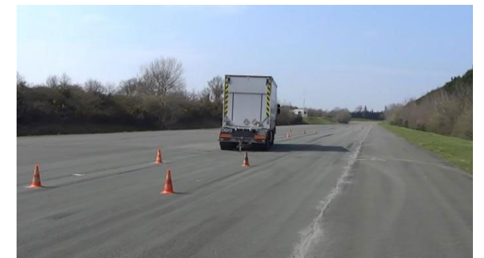
▲ Overturning tests