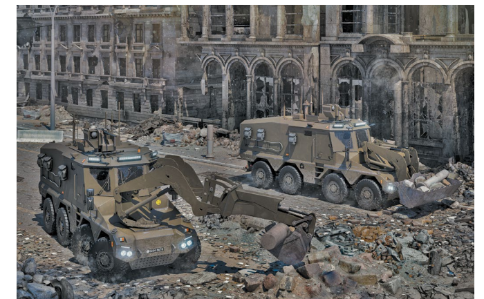
▲ Can operate in urban environments