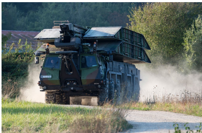
▲ MLC 85T/100W

With a top speed of 80 kph , the Modular Assault Bridge is a rapid, highly mobile off-road vehicle . It is armoured and equipped with a high-performance perimeter detection system for use in entirely automatic bridge-laying operations, ensuring that this modular assault bridge's operators remain safe.