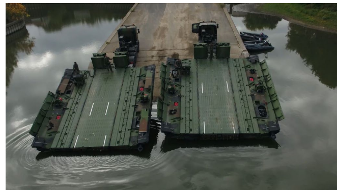
▲ 2 PFM trucks = MLC 40 ferry